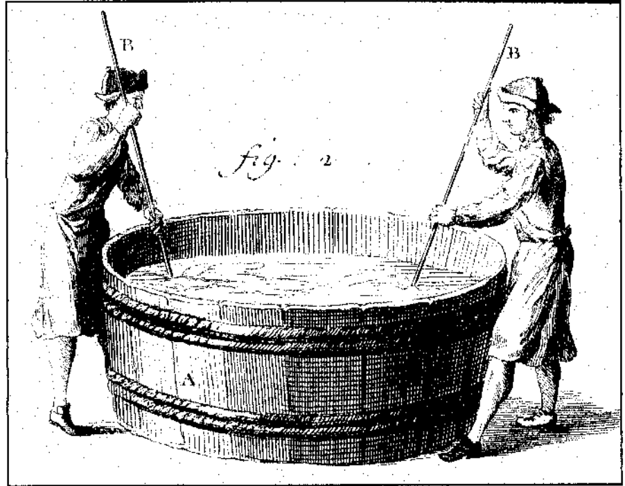
"Did they say they wanted Grass Green or Willow Green?"

No one that I've spoken to over the last quarter century has any proof of